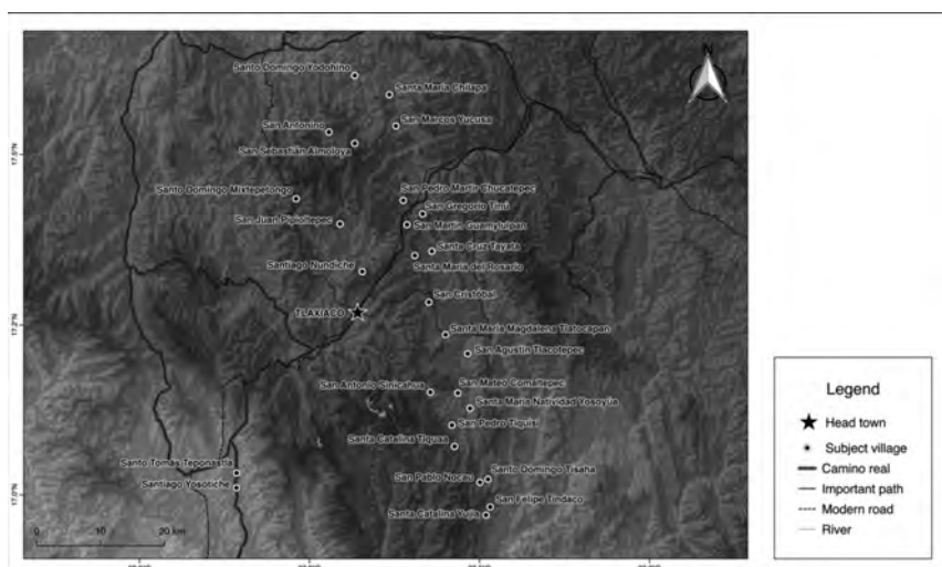
FIGURE 2 Map of the villages under the jurisdiction of Tlaxiaco, 1599